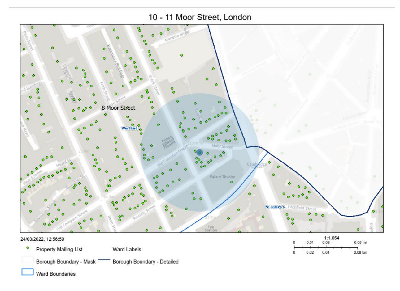
Resident Count = 82